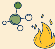
2 FIRE ROASTED